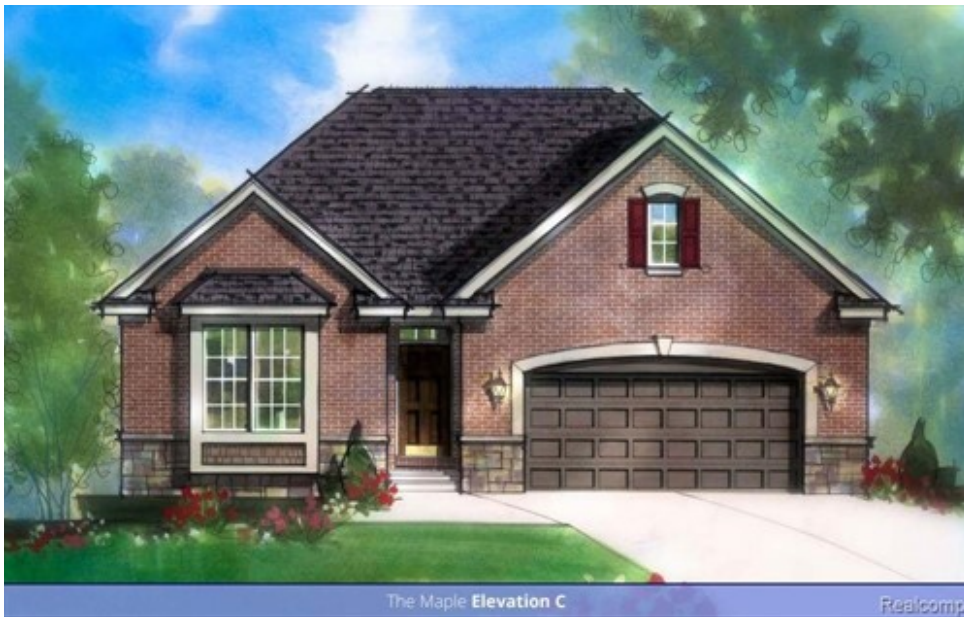
The Maple Elevation C